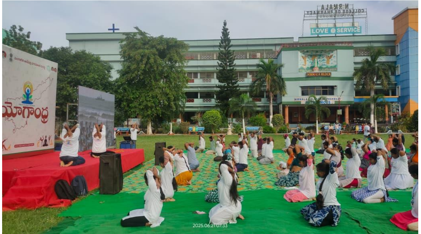
Students Performing Yoga Asanas under the Guidance of the Trainer on Yoga Day

Ph: 08645-236255, 236722, 9912342142, E-mail: ncpa_csagp@yahoo.co.in Web site: www.ncpacsag.ac.in