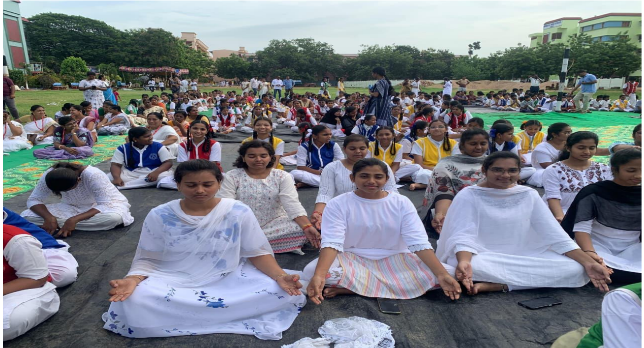
Students Performing Yoga Asanas Under the Guidance of the Trainer on Yoga Day

Ph: 08645-236255, 236722, 9912342142, E-mail: ncpa_csagp@yahoo.co.in Web site: www.ncpacsag.ac.in